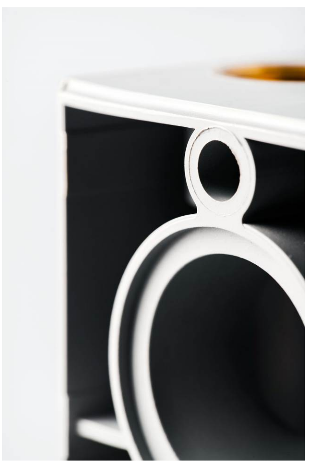
Fig. 5: Housing for WITTMANN flow controllers