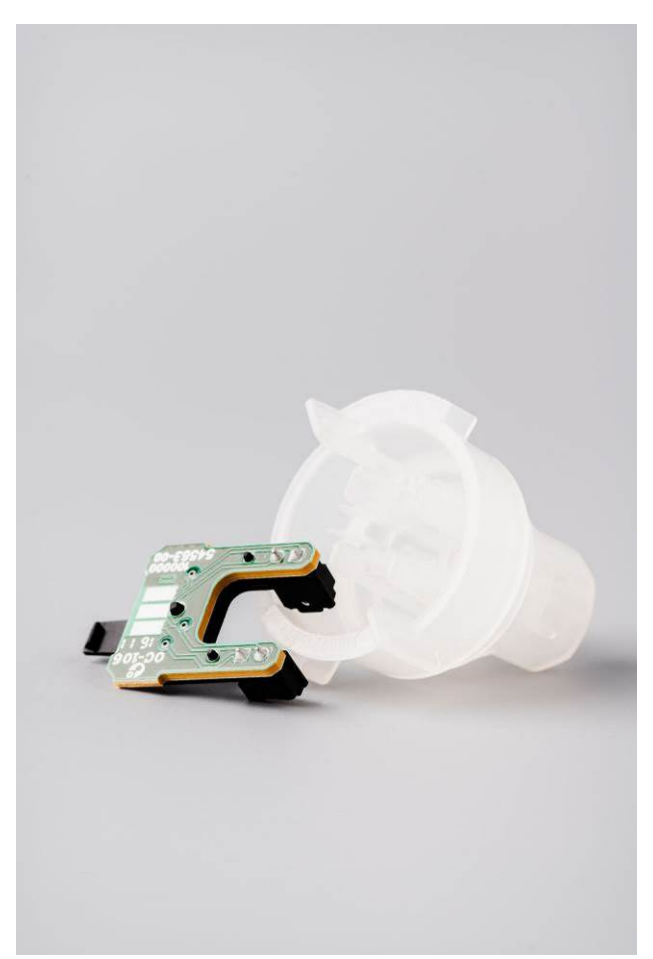
Fig. 4: Housing for aqua sensors to measure the water quality in BSH dishwashers