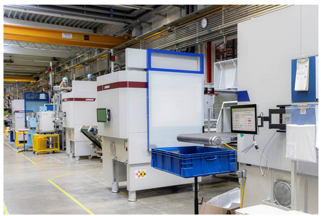
Fig. 2: SmartPower machines from WITTMANN BATTENFELD designed as Insider cells with WITTMANN linear robots