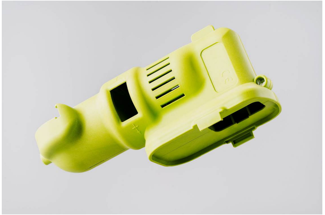
Fig. 6: Housing for an electrical tool